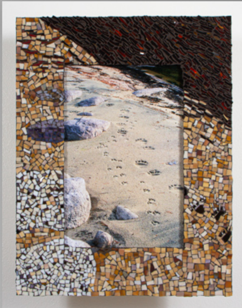
"Wolf n Bear"