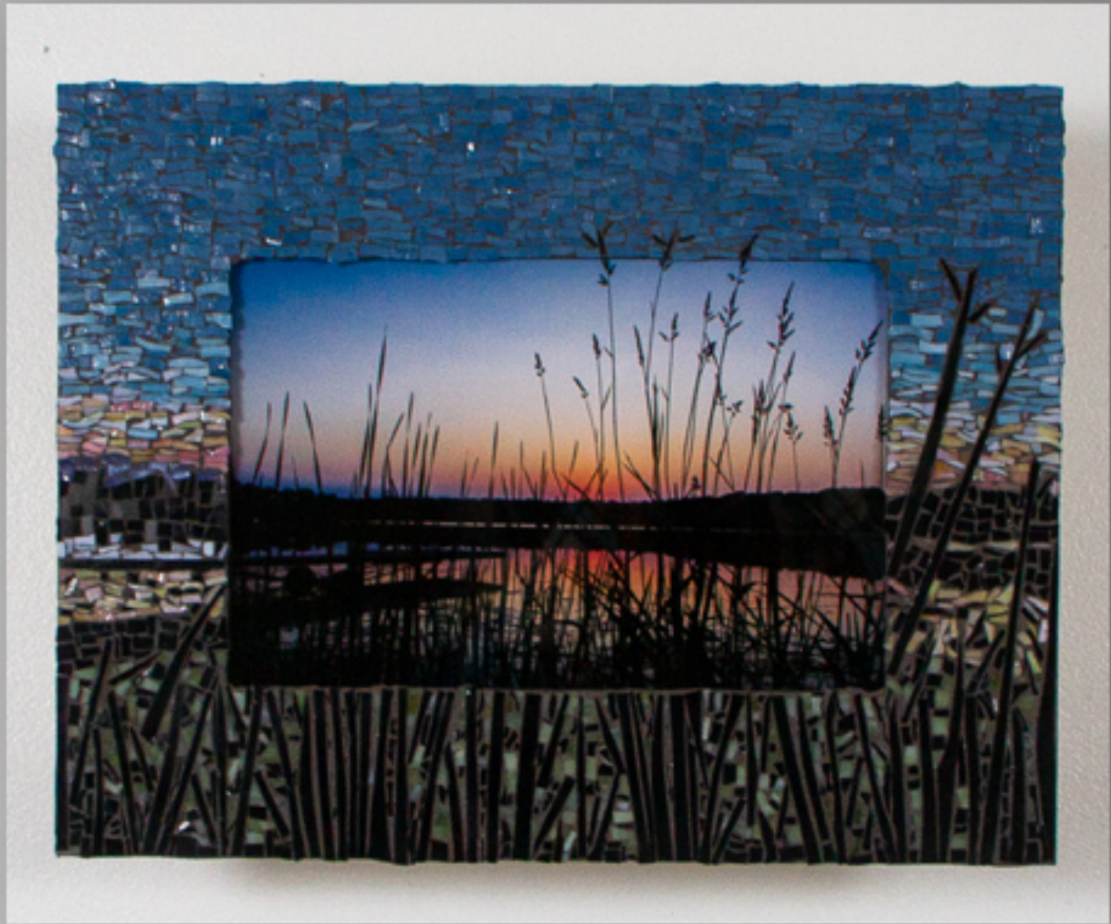
"End of Day"