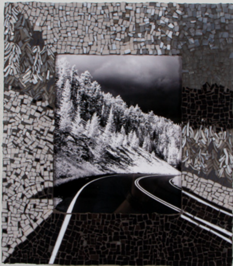
"Pine Edged Road"