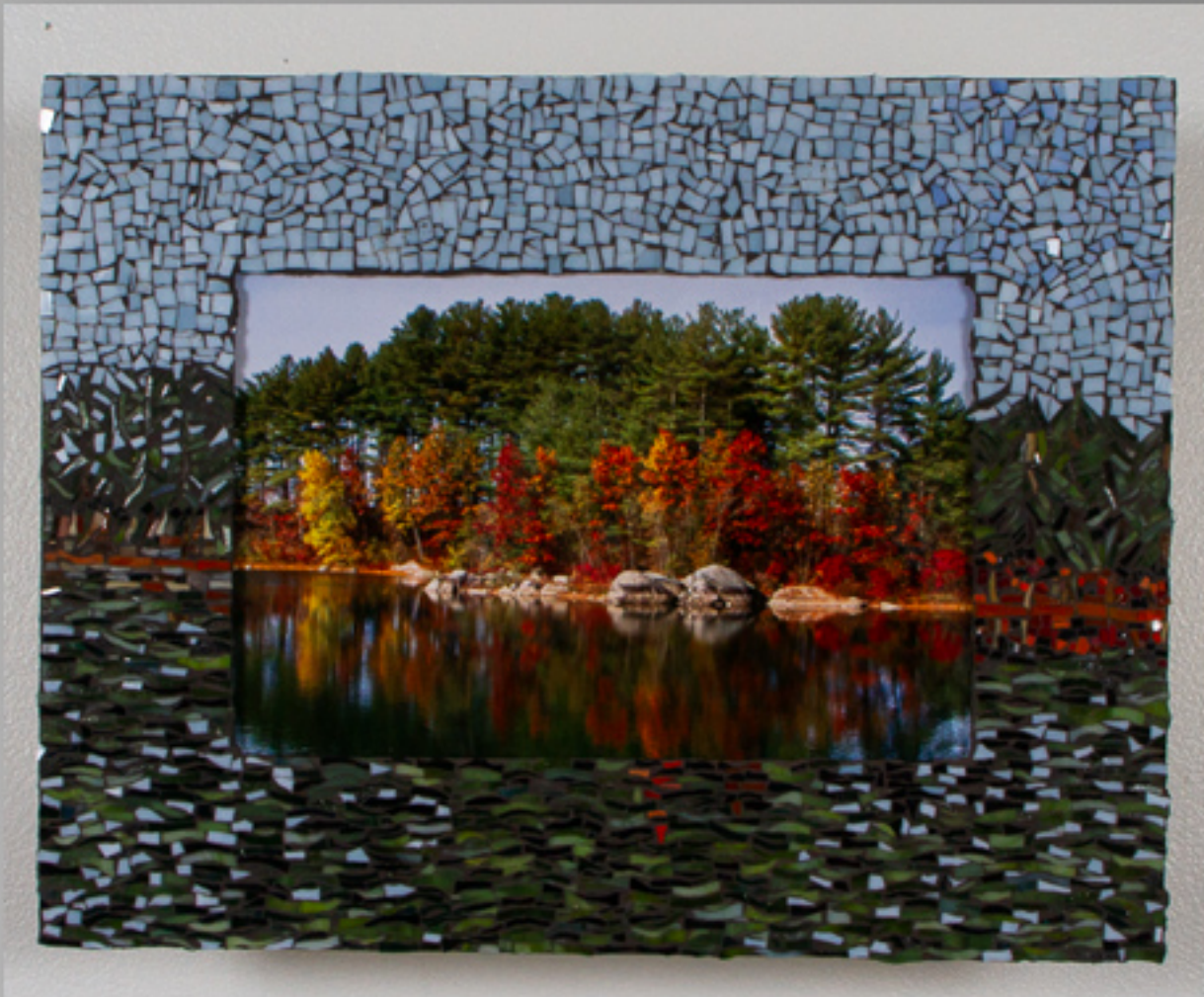
"Reflections on Wachusetts II"