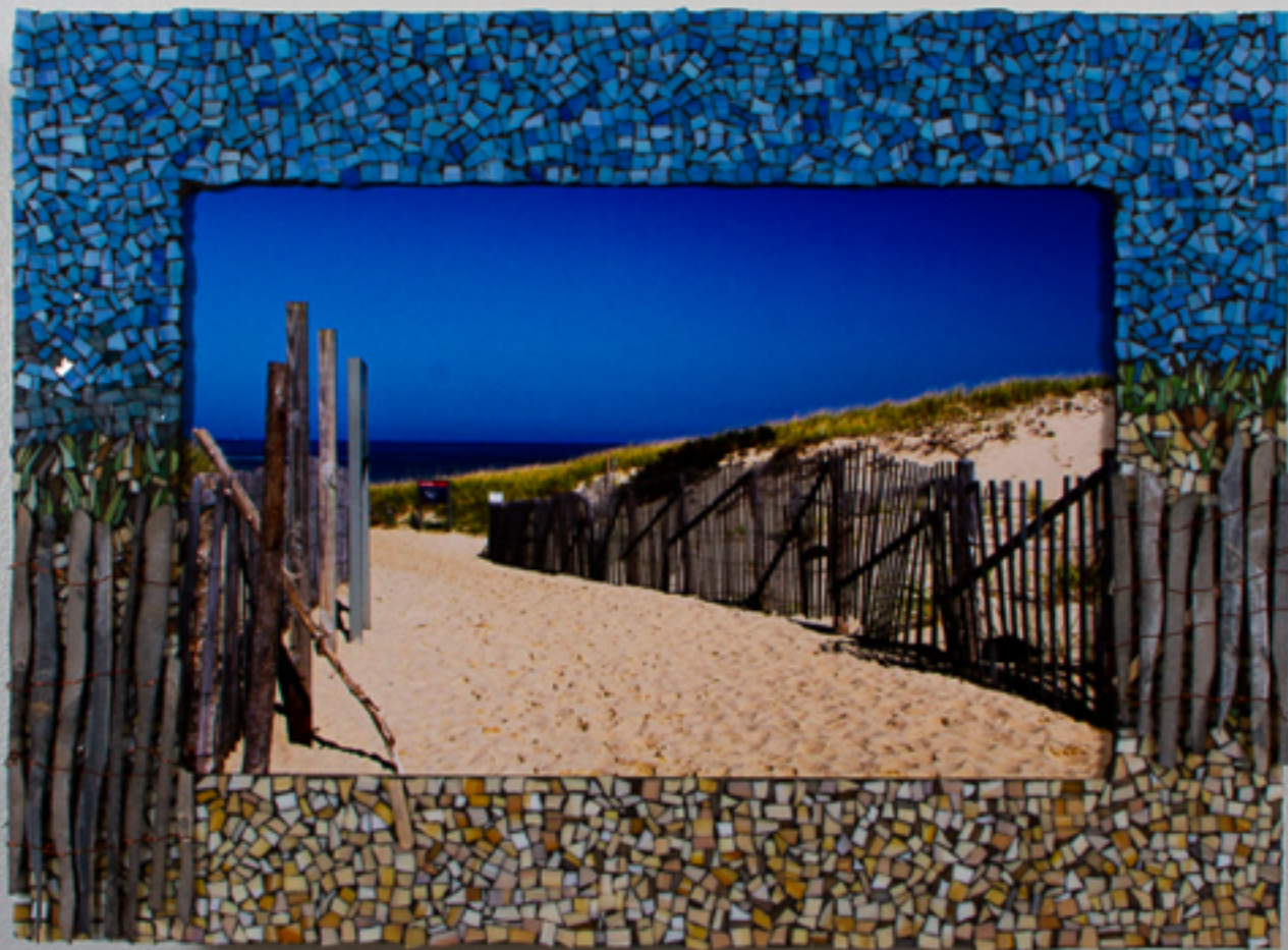
"Gateway To racepoint Beach"