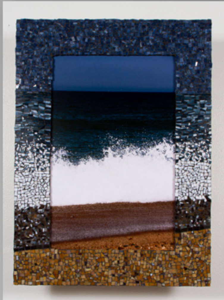
"Breakpoint at Racepoint"