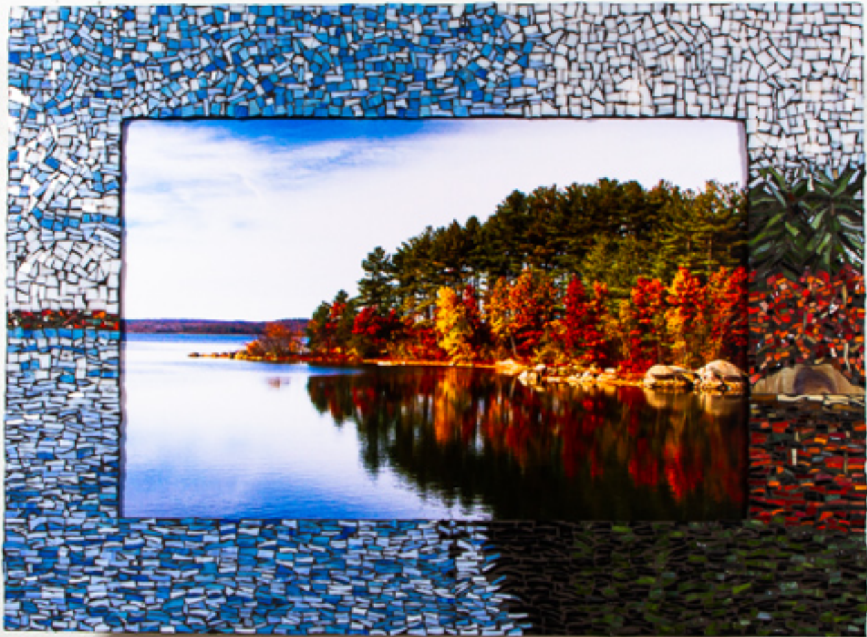
"Reflections on Wachusett's"