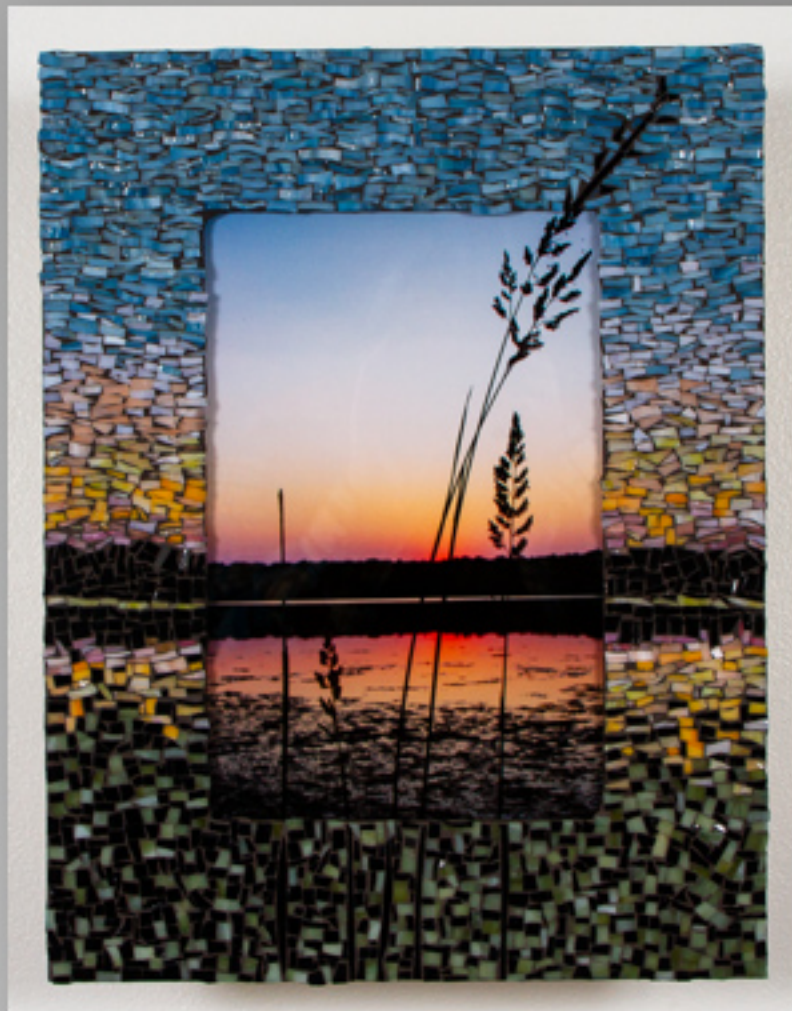
"Hint of Gold sunset"