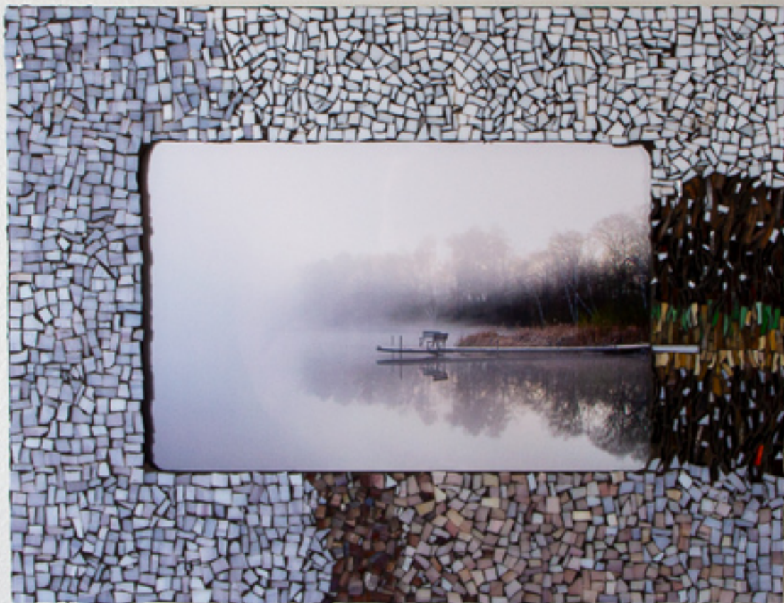
"Alone in the fog"